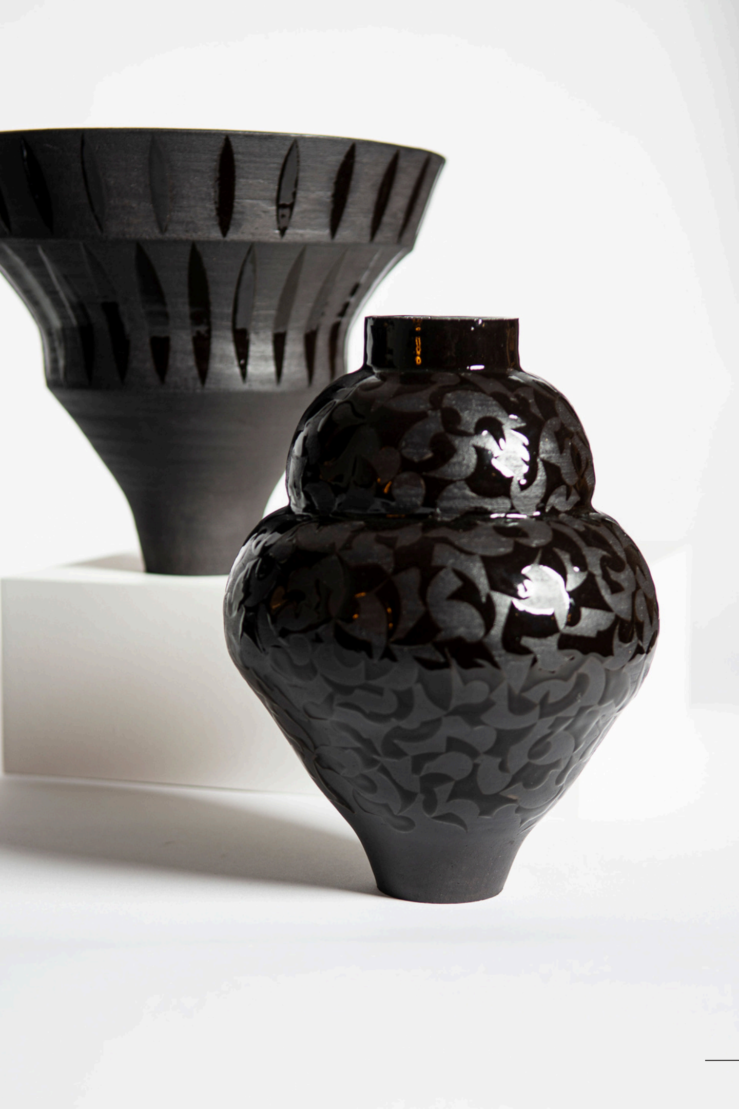
h23 x w17 x d17 cm