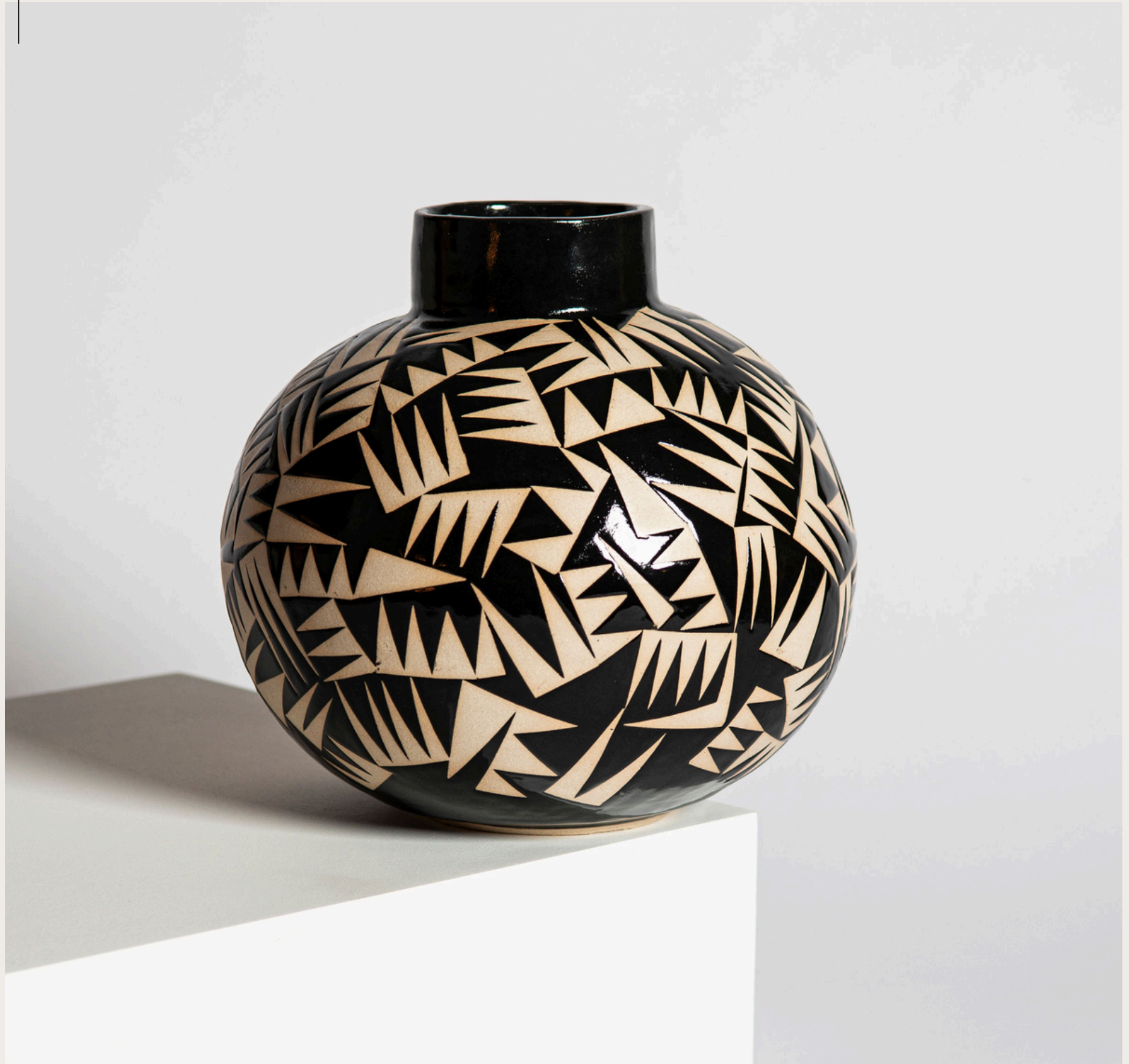
h19.5 x w20 x d20 cm