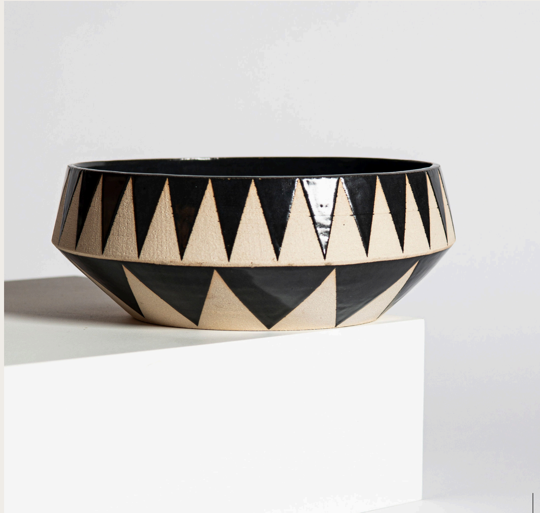
h8 x w20.5 x d20.5 cm