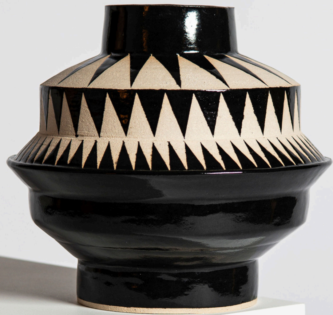
h17 x w17.5 x d17,5 cm