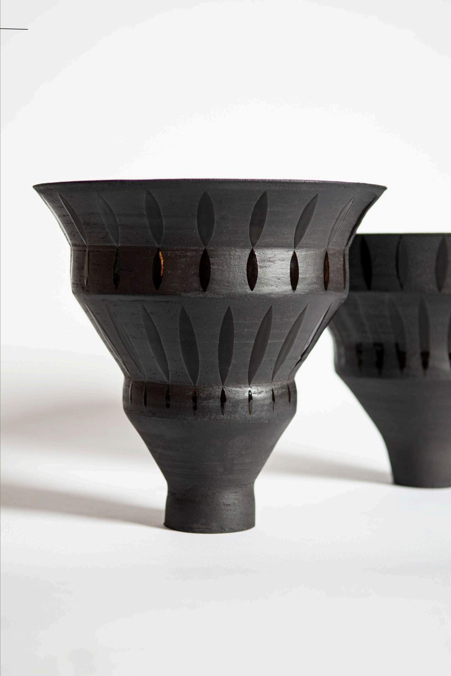
h24.2 x w25 x d25 cm