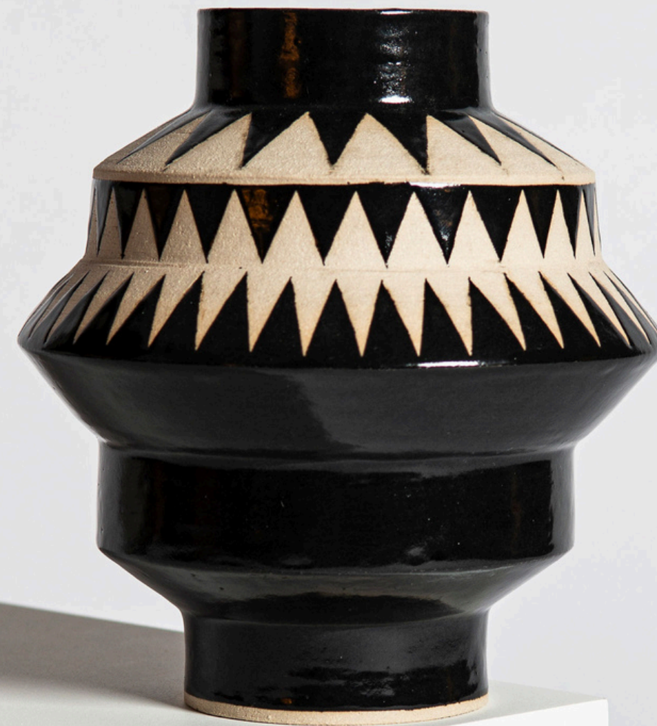
h17 x w16.5 x d16.5 cm